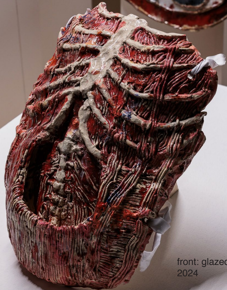
front: glazed ceramic torso, 2024