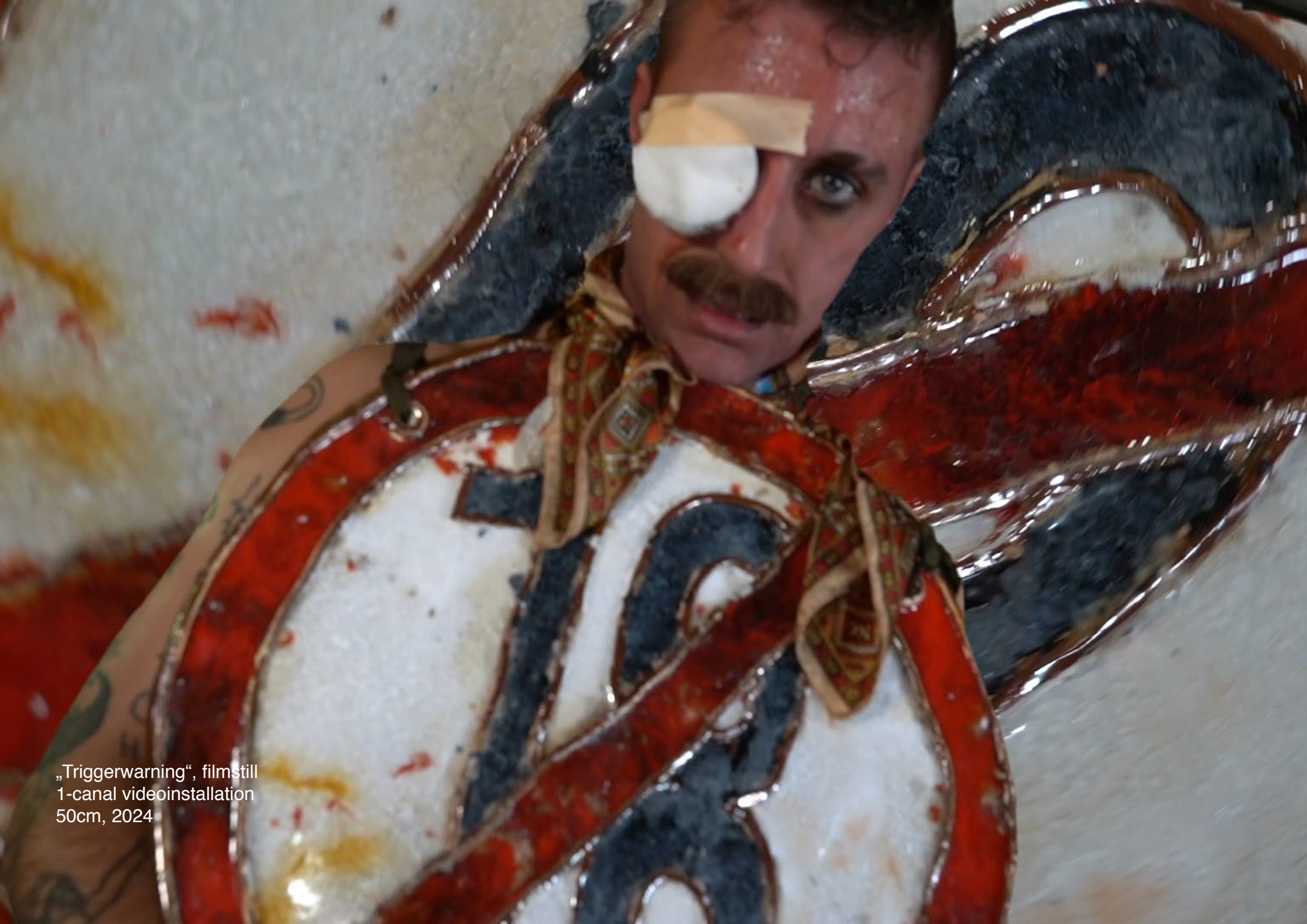
„Triggerwarning“, filmstill 1-canal videoinstallation 50cm, 2024