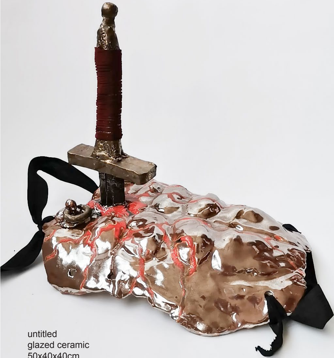
untitled glazed ceramic 50x40x40cm 2021