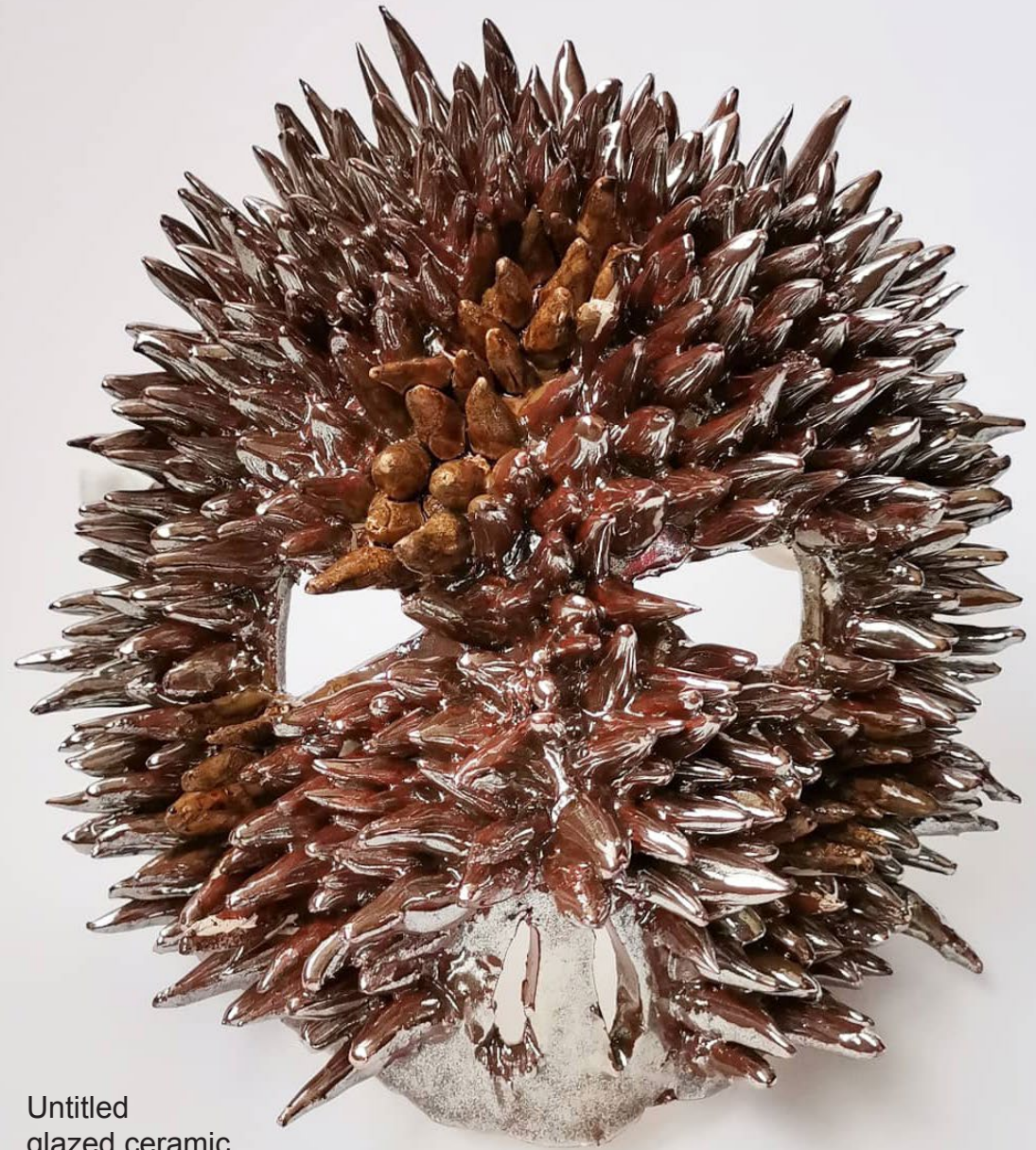
Untitled glazed ceramic 20x18x10cm 2021