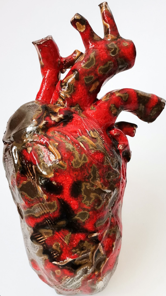
Heart glazed ceramic 17x8cx5cm 2021

hybrid performance between visual art, sculpture, concert and live photo shoot. Pumping hearts, sweat, competition and toxic college boys who discover more than just their feelings.