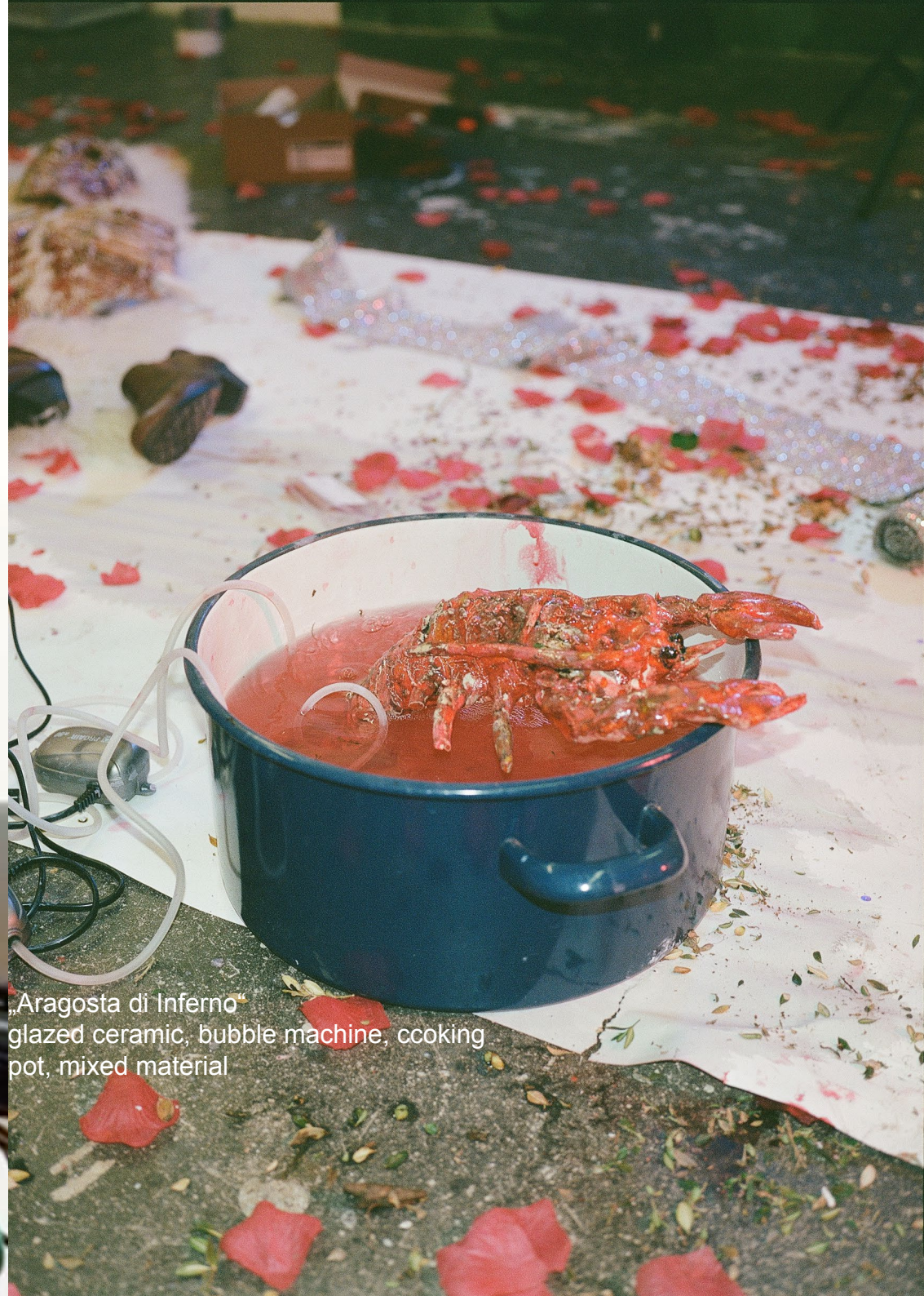
„Aragosta di Inferno“ glazed ceramic, bubble machine, cooking pot, mixed material