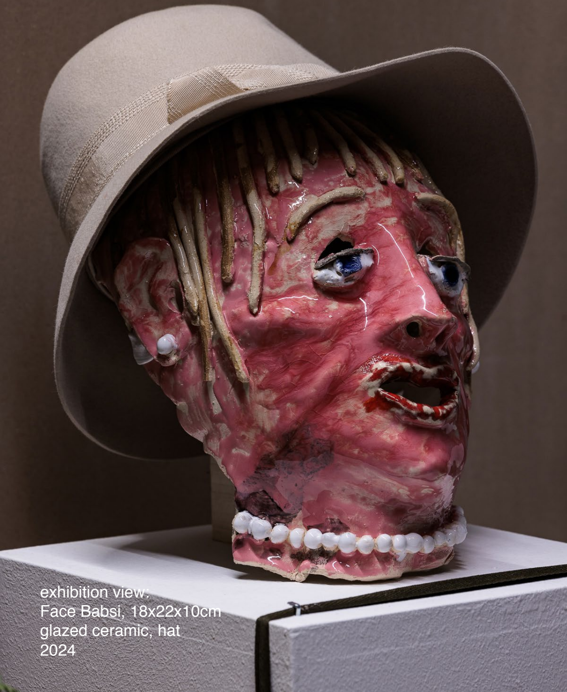
exhibition view: Face Babsi, 18x22x10cm glazed ceramic, hat 2024