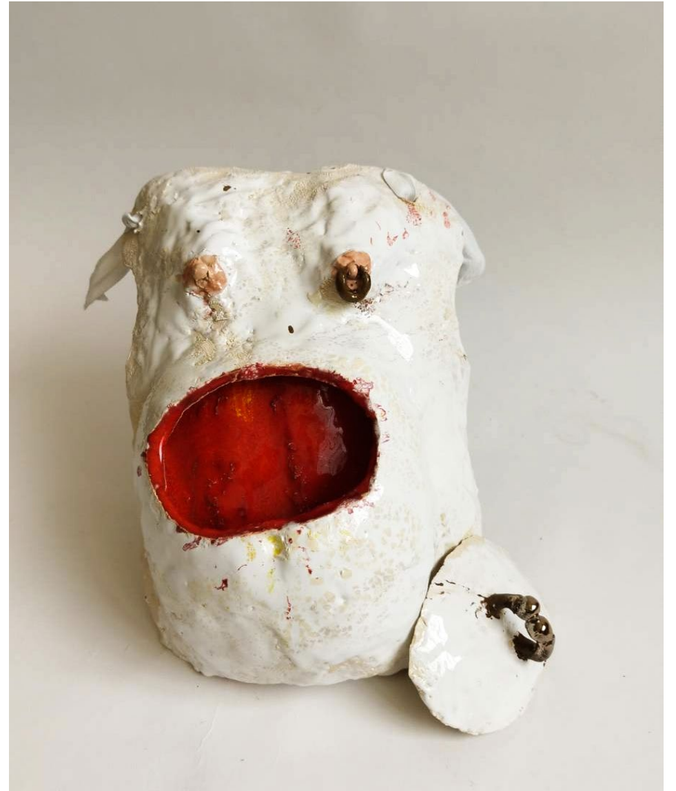
„Basils Belly“ 52x20x45cm, glazed ceramic