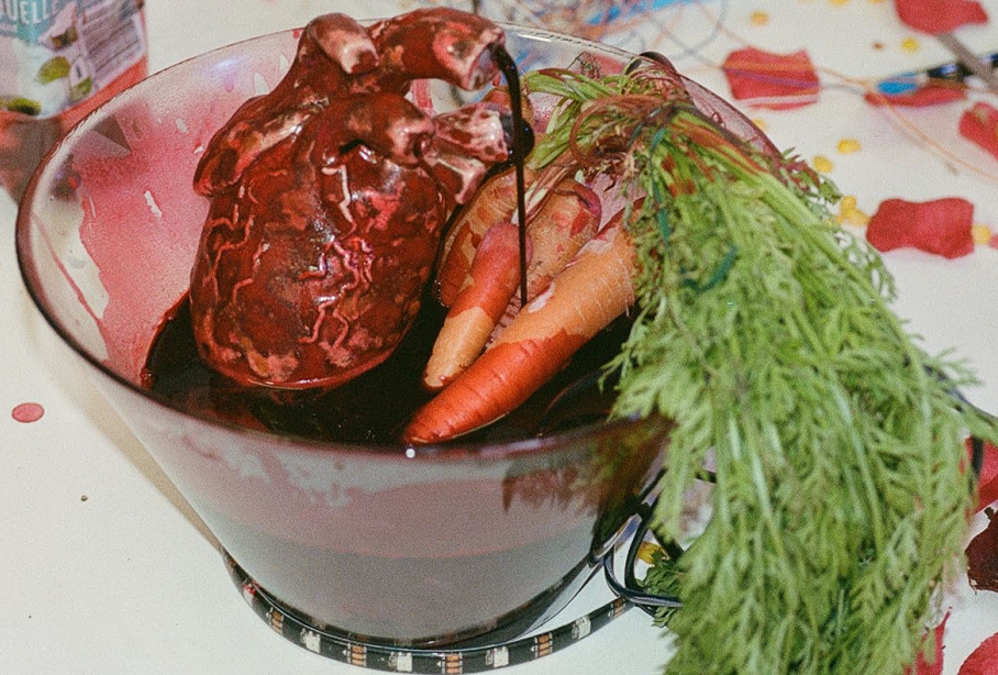
„Insalata di Sentimenti“,

glazed ceramic, carrots, fake blood, pump, empty water bottle and mixed material