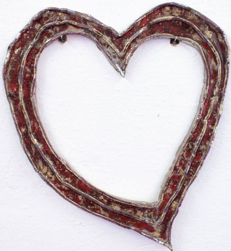
„heart of glass“