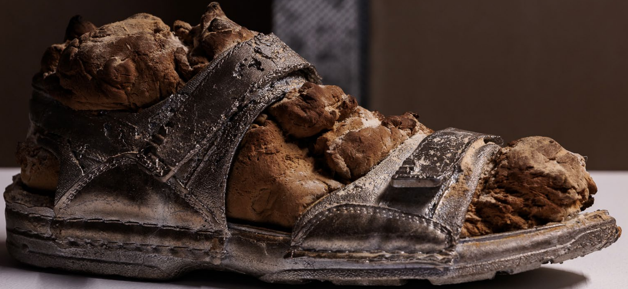
„Strada del Sole“ alucast, bread 42x7x10cm