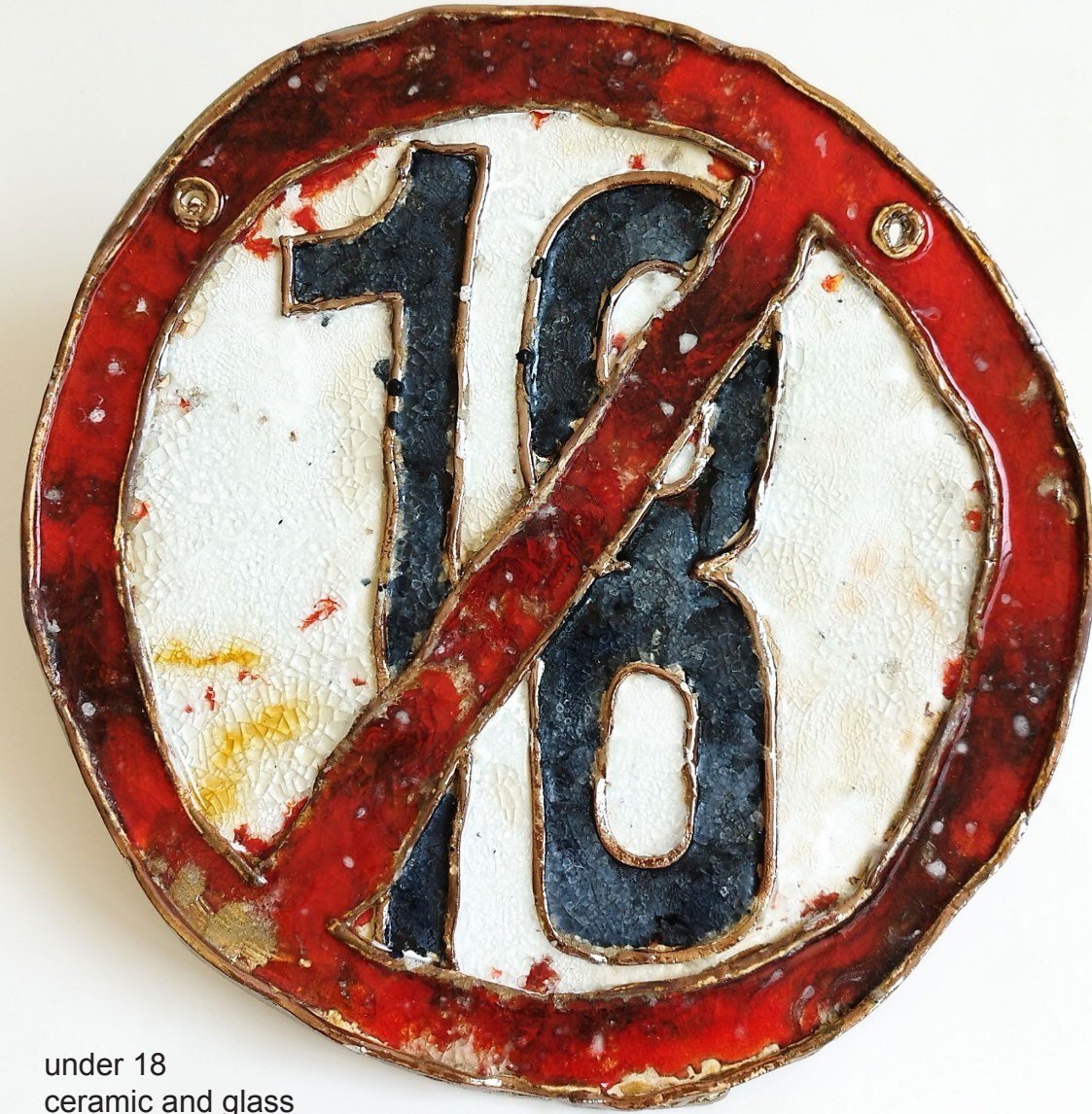
under 18 ceramic and glass 50cm, 2024