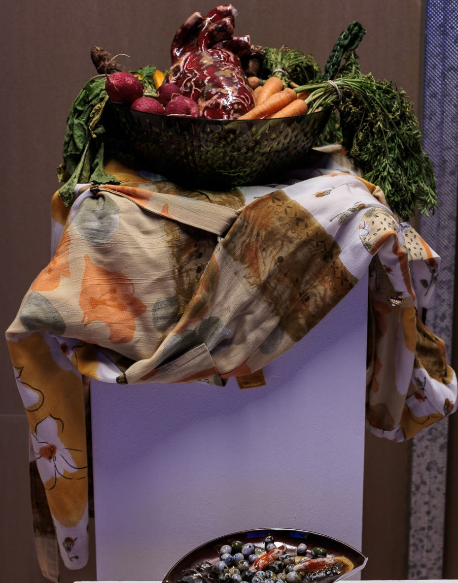
front: „Würstchen mit Erbsen und Saft found Object, stainless steel, and stone- ware fused with glaze.