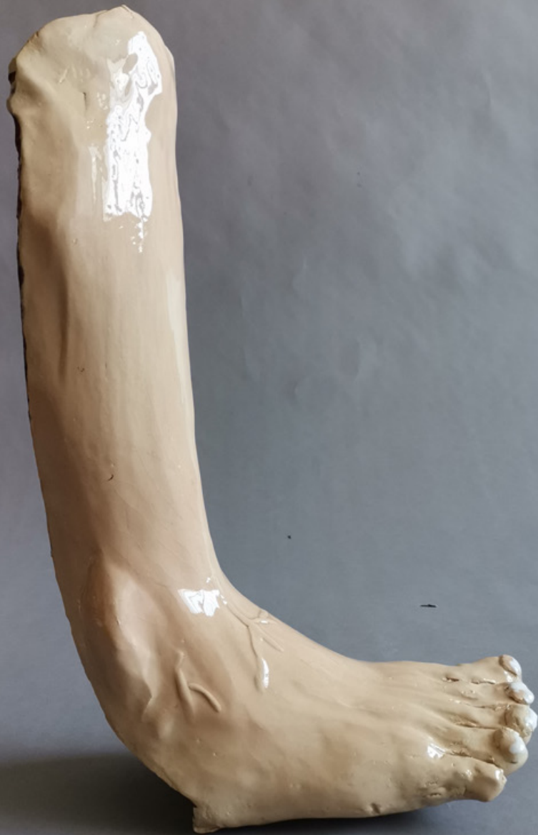
„Soßenfüßchen“ glazed ceramic 40x10x25cm