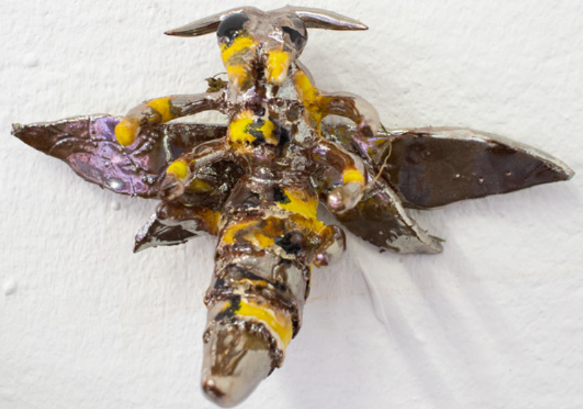
WASP III glazed ceramic 15cmx15cmt