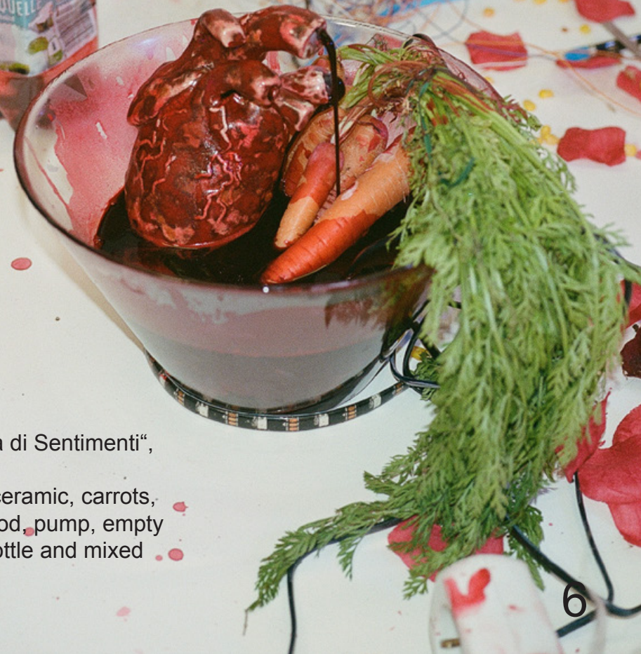
„Insalata di Sentimenti“,

glazed ceramic, carrots, fake blood pump, empty water bottle and mixed material