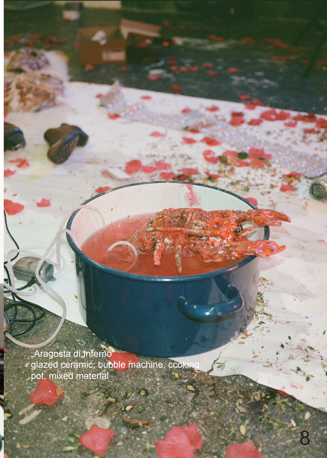
„Aragosta di Inferno“ glazed ceramic, bubble machine, cooking pot, mixed material